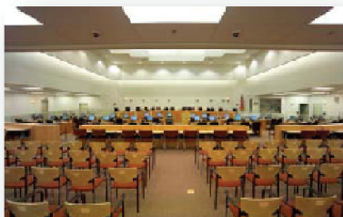
ASLB Hearing Room, Rockville, Md.

The principal venue for prehearing conferences will be the NRC’s Las Vegas Hearing Facility, a multimedia facility established specifically for the Yucca Mountain proceeding. Other conferences could be held at the NRC hearing room at agency headquarters in Rockville, Md.