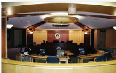
Las Vegas Hearing Facility

One or more ASLBs – each consisting of three judges – will be appointed to conduct the hearing. The ASLB(s) may conduct a prehearing conference to discuss any petitions filed and hear oral arguments from potential parties about why they have standing and why their contentions should be admitted into the hearing. Participation in the prehearing conference will be limited to DOE, NRC staff, potential parties and interested governmental participants, although members of the public who have not sought to participate may attend and observe.