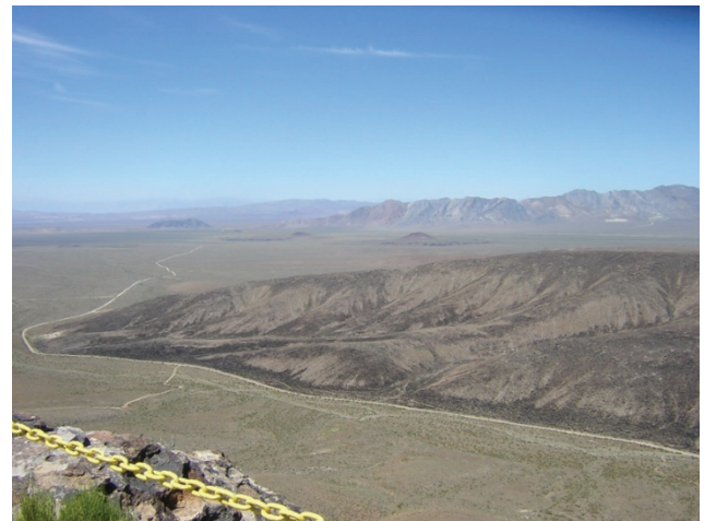
Yucca Mountain, Nevada